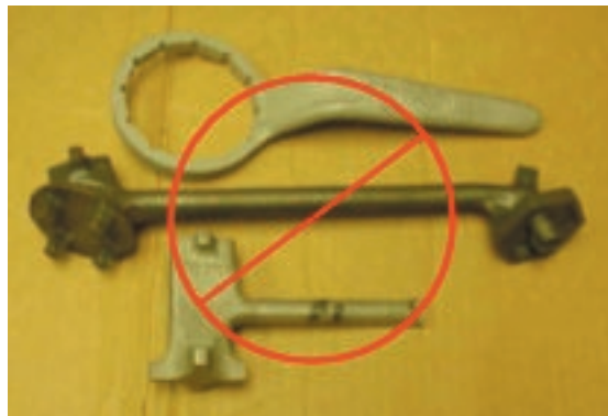
Wrenches suitable to open and re-close drums for in house use. Cannot be used to close drums for shipment of hazardous materials.