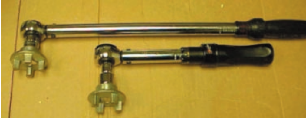
Top:Craftsman (Sears) 210 N-m Bottom:Performance Tool Brand 29 N-m

The plug or cap is inserted into the appropriate opening and screwed down hand tight until the gasket is in contact with the sealing surface. A torque wrench capable of applying the proper torque to the fitting as specified by the closing instructions is then used to tighten the plug or cap until it reached the pre-set torque. The following are photographs of various torque wrenches Mauser has found suitable to apply the required closing torque.