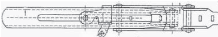
Lever Lock Side View