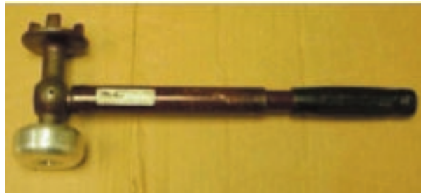
Rieke® Pre-set torque wrench 34 N-m